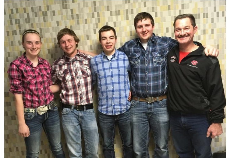
2018 Door County 4-H Dairy Quiz Bowl Team 2nd Place—Senior Division Wisconsin 4-H Dairy Quiz Bowl Contest